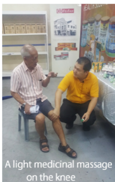
A light medicinal massage on the knee

Our next stop was at the Fei Fah Medical Manufacturing at Kaki Bukit Avenue 1. This was a regular favourite of the elderly folk who, before the visit, had already made up their decision to combine their requirements for a bulk purchase of a certain medicinal ointment which they had used and been pleased with its efficacy.