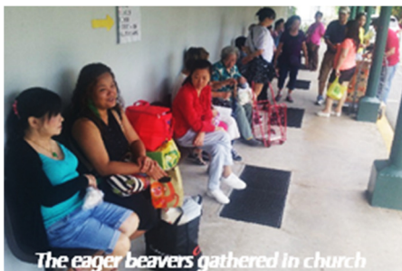
The eager beavers gathered in church

The annual CNY shopping trip is a perennial favourite for many shopping enthusiasts among the members of the Dialect Ministry.